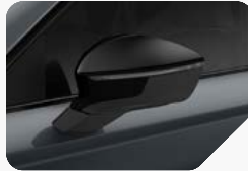
Rhodium Grey VZ1 | VZ2 | VZ3