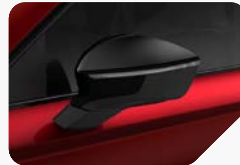
Velvet Red VZ1 | VZ2 | VZ3