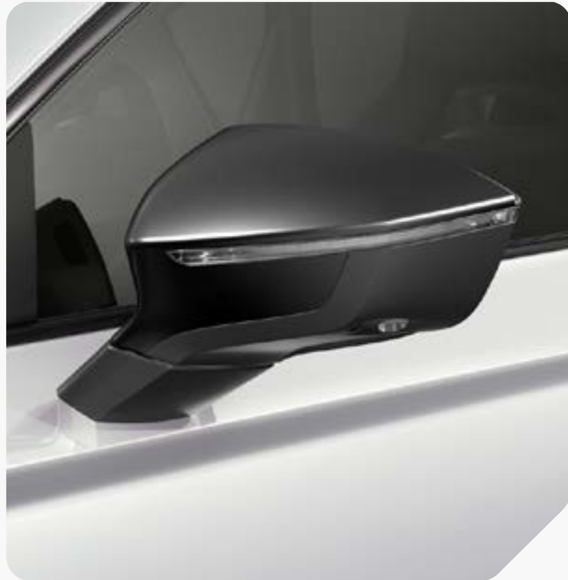
Bila White VZ1 | VZ2 | VZ3