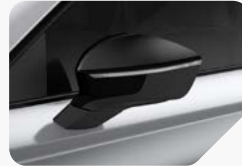
Nevada White VZ1 | VZ2 | VZ3