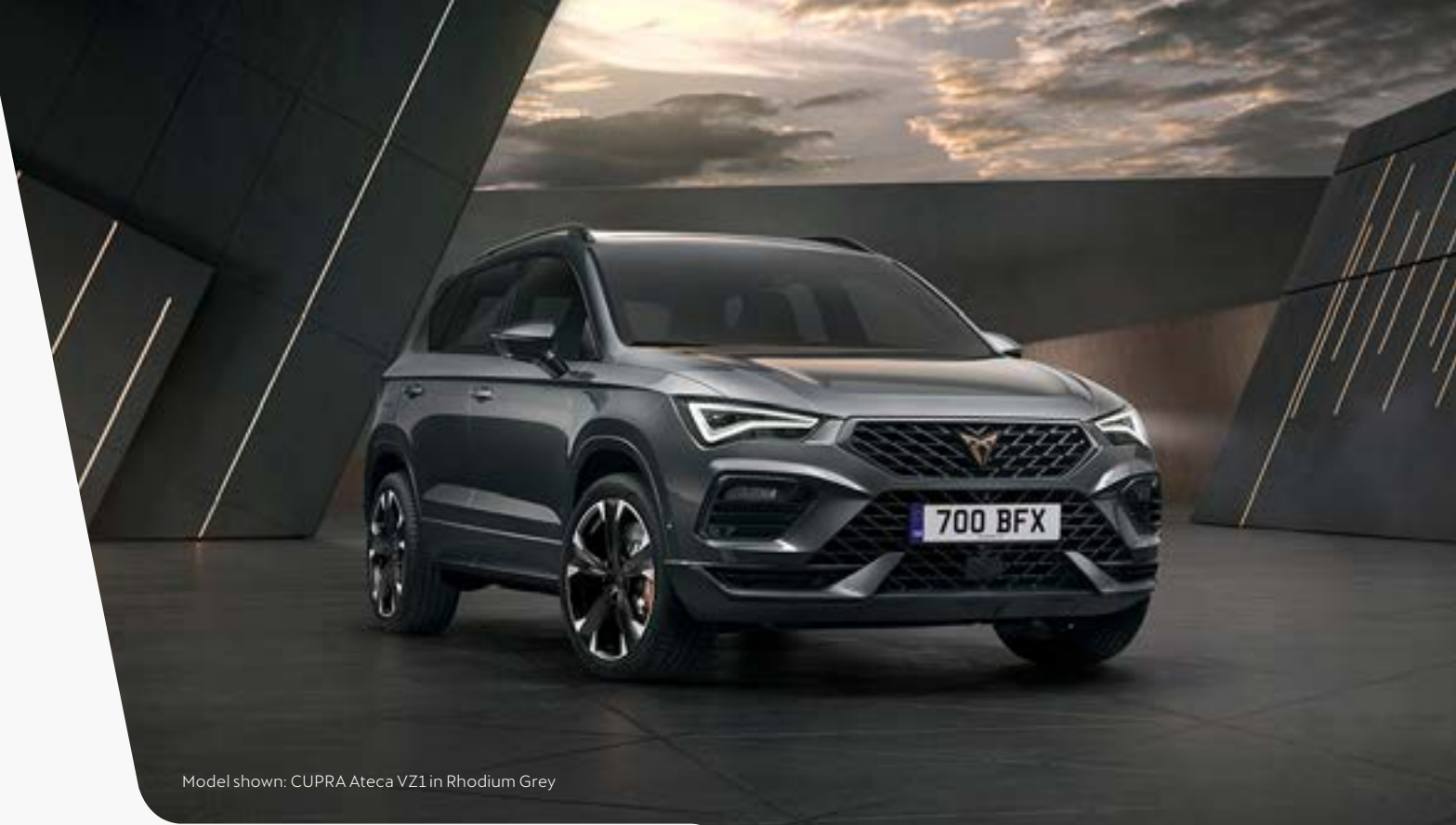
Model shown: CUPRA Ateca VZ1 in Rhodium Grey

The CUPRA Connect services can be operated only by using available public communication technologies. Please note that due to development of these technologies, especially mobile networks, CUPRA cannot guarantee consistent availability in all countries for the duration of CUPRA Connect services. Possible changes in technology may cause permanent unavailability of them.