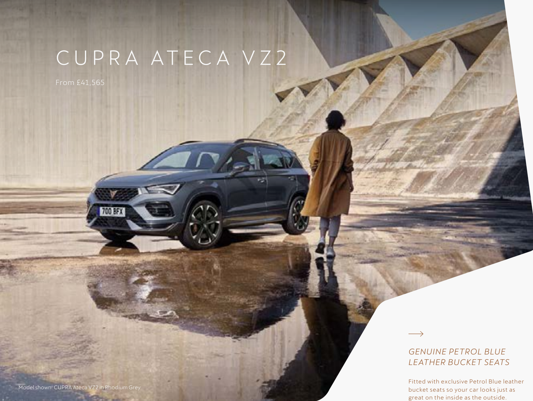
Model shown: CUPRA Ateca VZ2 in Rhodium Grey