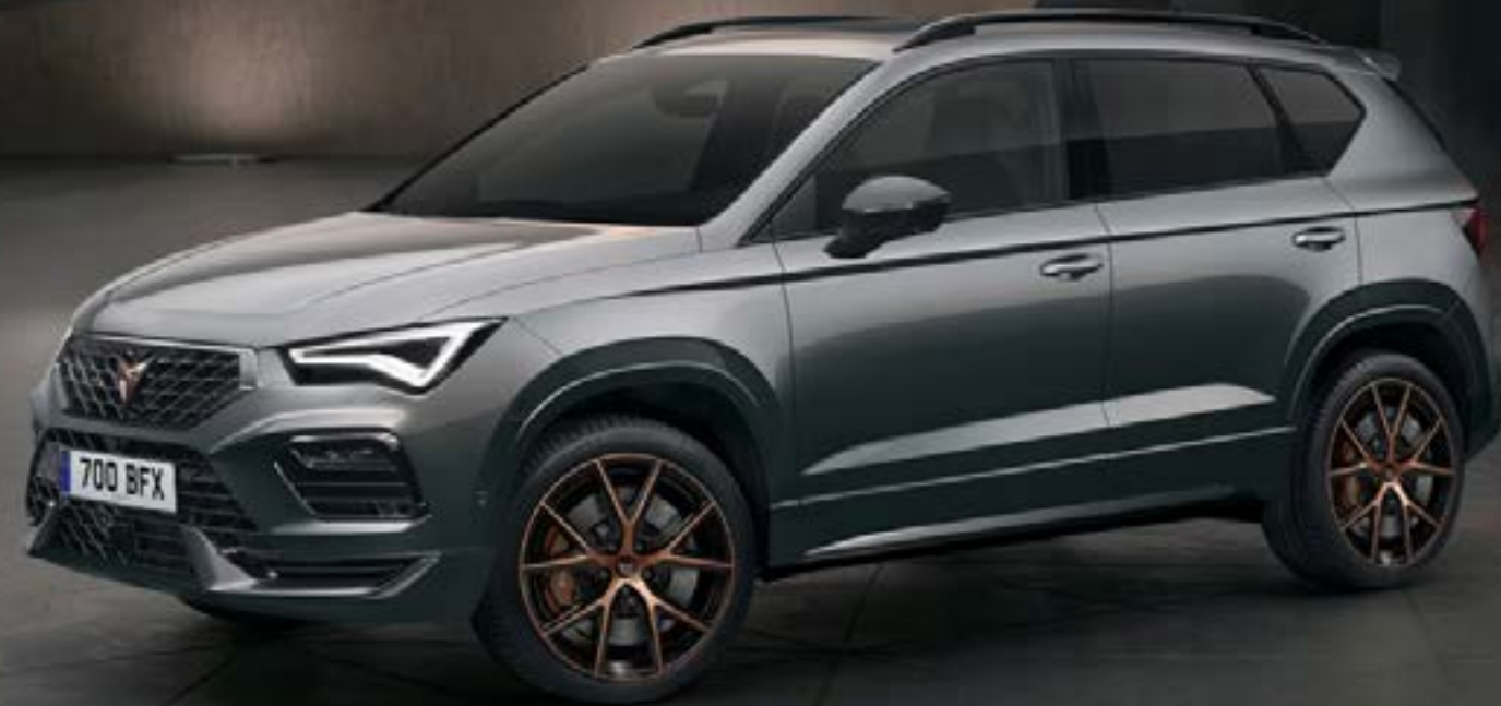
Model shown: CUPRA Ateca VZ3 in Rhodium Grey