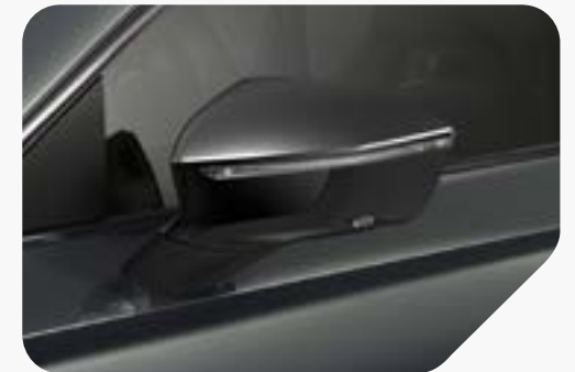
Dark Camouflage VZ1 | VZ2 | VZ3