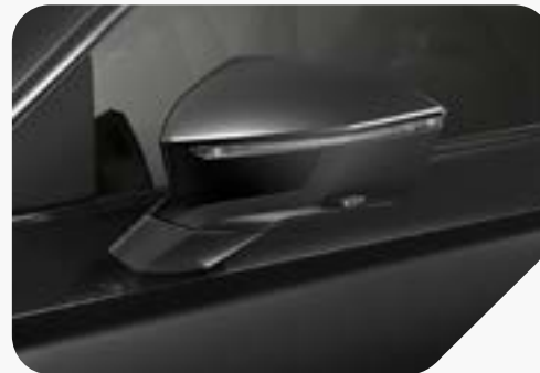
Black Magic VZ1 | VZ2 | VZ3