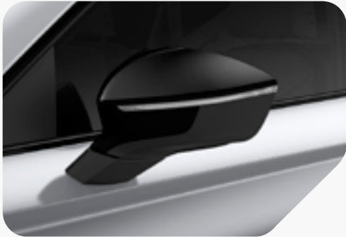
Nevada White VZ1 | VZ2 | VZ3