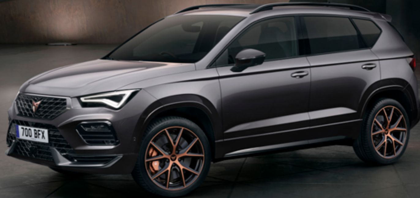
Model shown: CUPRA Ateca VZ3 in Graphite Grey