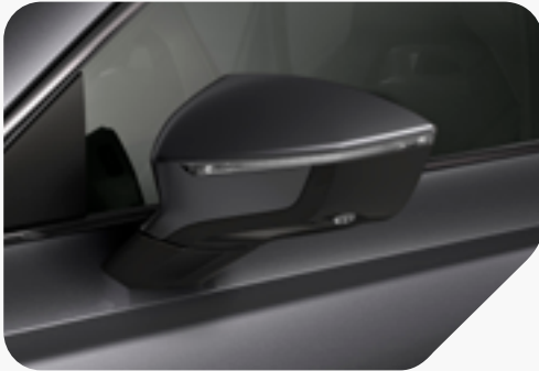
Graphite Grey VZ1 | VZ2 | VZ3