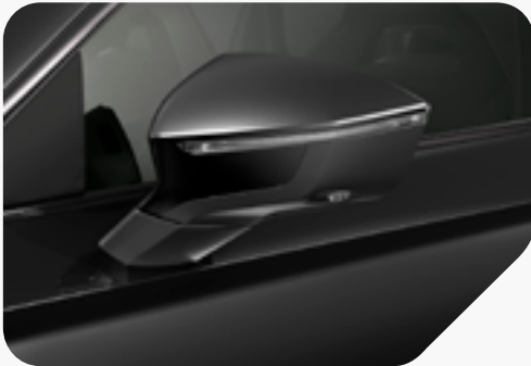
Black Magic VZ1 | VZ2 | VZ3