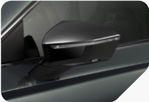
Dark Camouflage VZ1 | VZ2 | VZ3