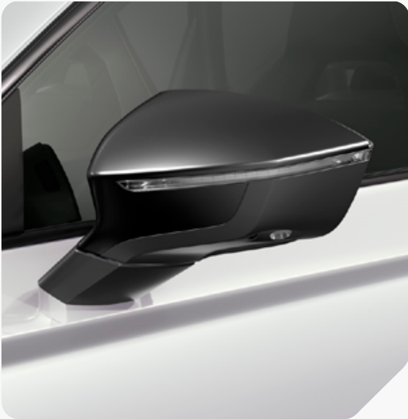
Bila White VZ1 | VZ2 | VZ3