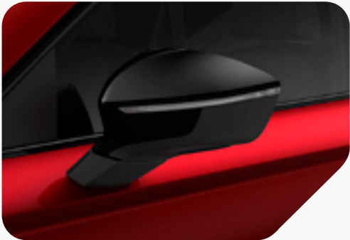
Velvet Red VZ1 | VZ2 | VZ3