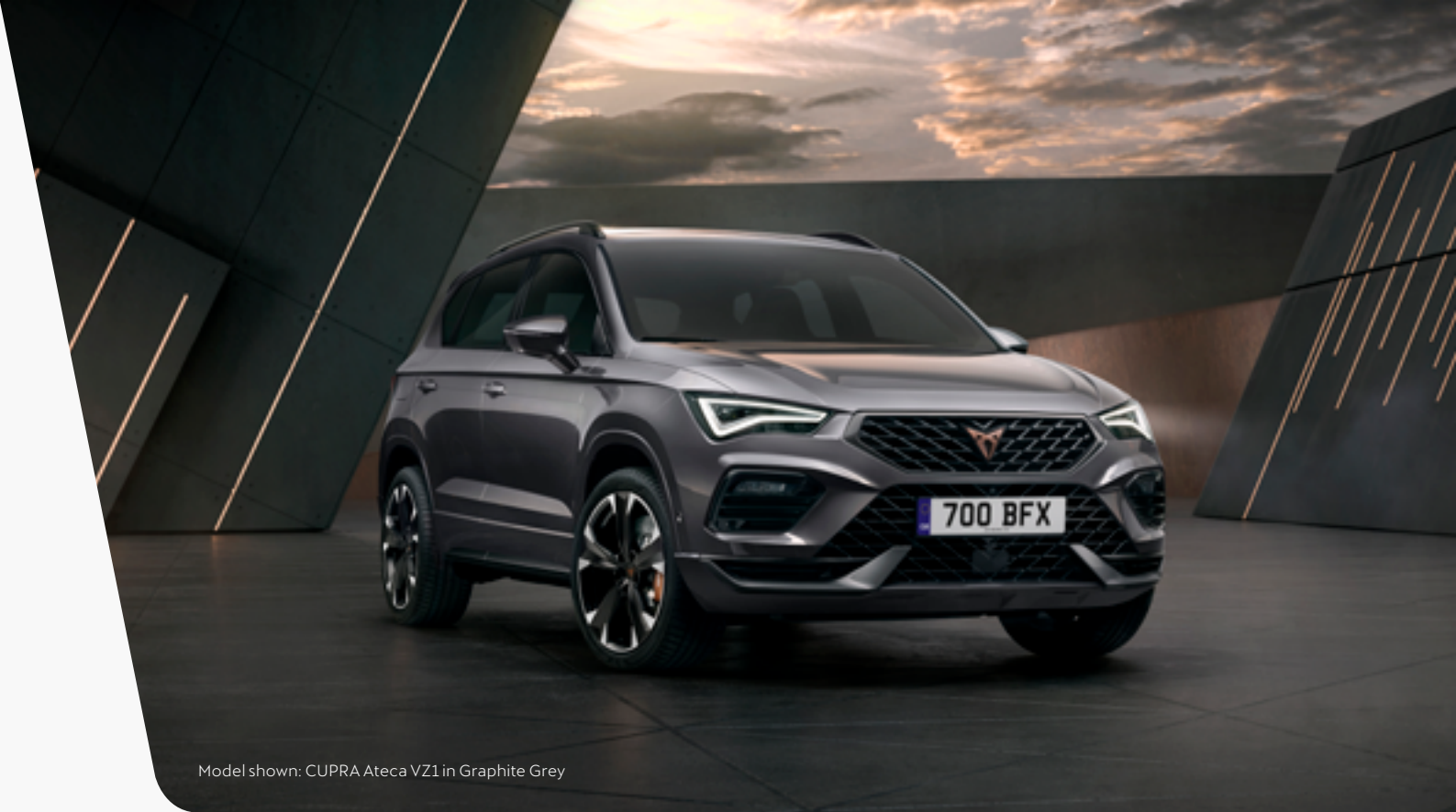
Model shown: CUPRA Ateca VZ1 in Graphite Grey

The CUPRA Connect services can be operated only by using available public communication technologies. Please note that due to development of these technologies, especially mobile networks, CUPRA cannot guarantee consistent availability in all countries for the duration of CUPRA Connect services. Possible changes in technology may cause permanent unavailability of them.