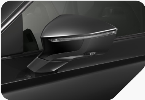
Black Magic VZ1 | VZ2 | VZ3