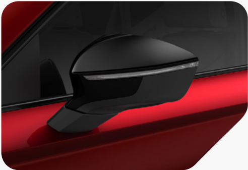
Velvet Red VZ1 | VZ2 | VZ3