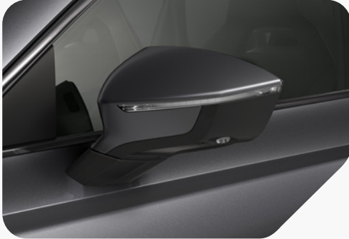
Graphite Grey VZ1 | VZ2 | VZ3