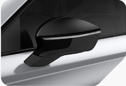
Nevada White VZ1 | VZ2 | VZ3