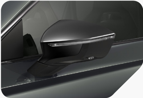
Dark Camouflage VZ1 | VZ2 | VZ3