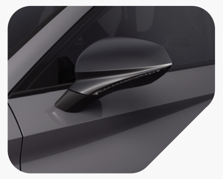
Graphene Grey VZ1 | VZ2 | VZ3