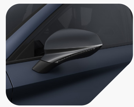
Petrol Blue VZ1 | VZ2 | VZ3