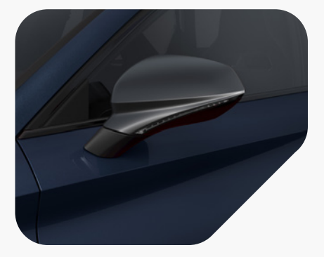
Asphalt Blue VZ1 | VZ2 | VZ3