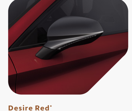
VZ1 | VZ2 | VZ3