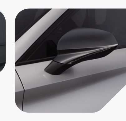
Urban Silver VZ1 | VZ2 | VZ3