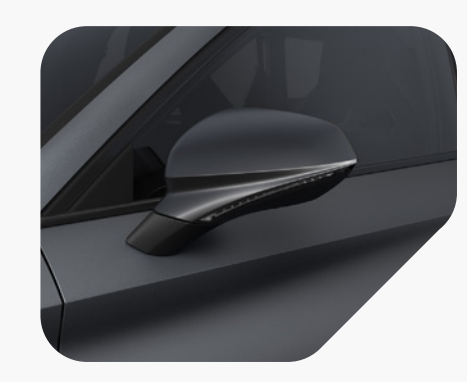
Magnetic Tech Grey VZ1 | VZ2 | VZ3