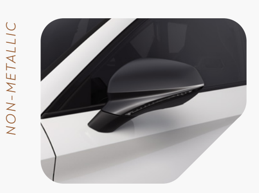
White VZ1 | VZ2 | VZ3