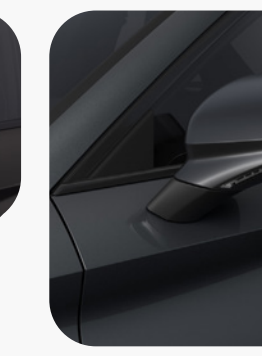
Magnetic Grey VZ1 | VZ2 | VZ3