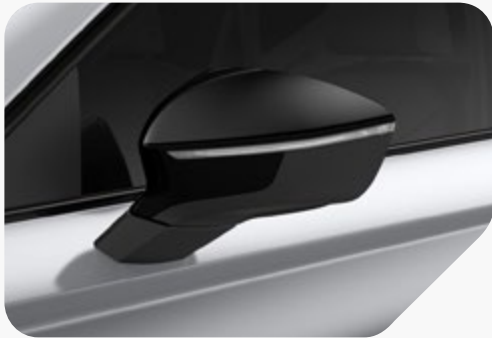
Nevada White V1 | V2 | VZ1 | VZ2 | VZ3