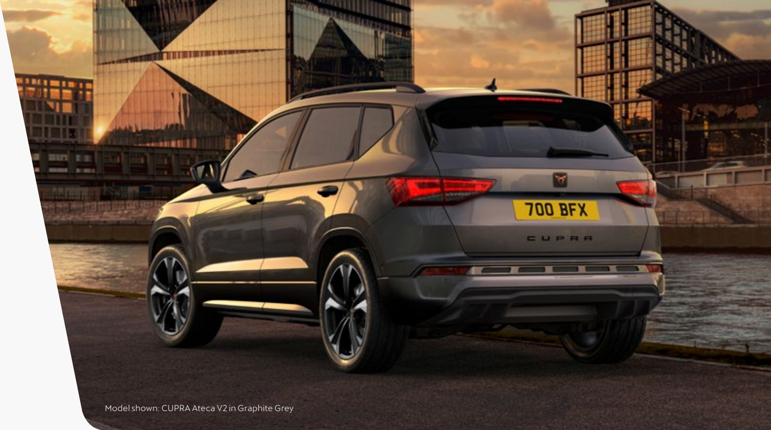
Model shown: CUPRA Ateca V2 in Graphite Grey

The CUPRA Connect services can be operated only by using available public communication technologies. Please note that due to development of these technologies, especially mobile networks, CUPRA cannot guarantee consistent availability in all countries for the duration of CUPRA Connect services. Possible changes in technology may cause permanent unavailability of them.