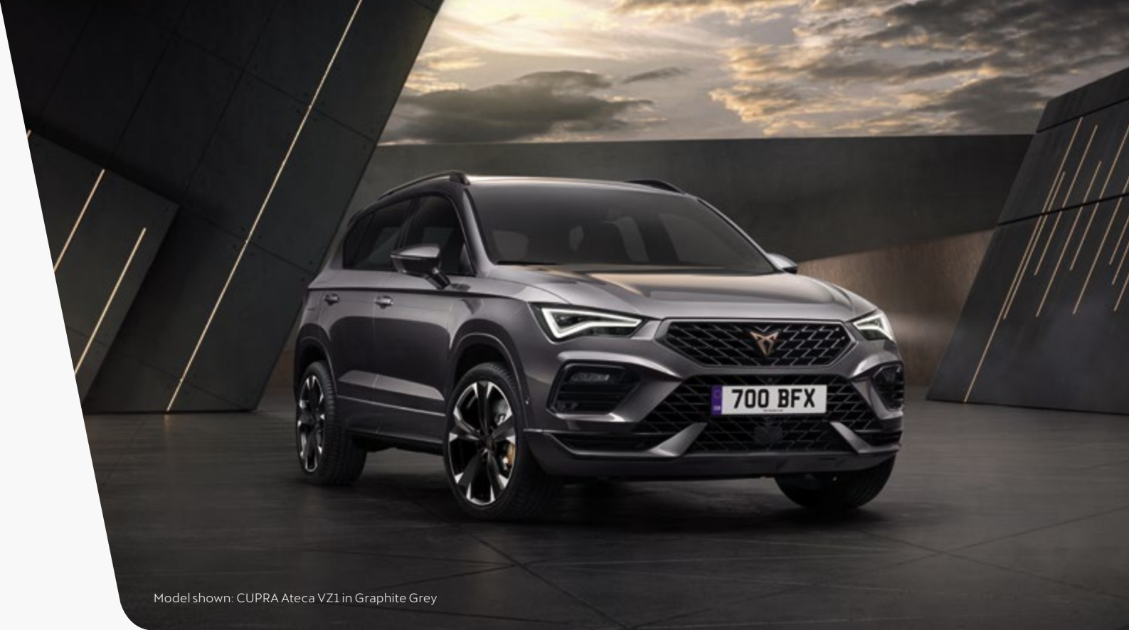
Model shown: CUPRA Ateca VZ1 in Graphite Grey

The CUPRA Connect services can be operated only by using available public communication technologies. Please note that due to development of these technologies, especially mobile networks, CUPRA cannot guarantee consistent availability in all countries for the duration of CUPRA Connect services. Possible changes in technology may cause permanent unavailability of them.