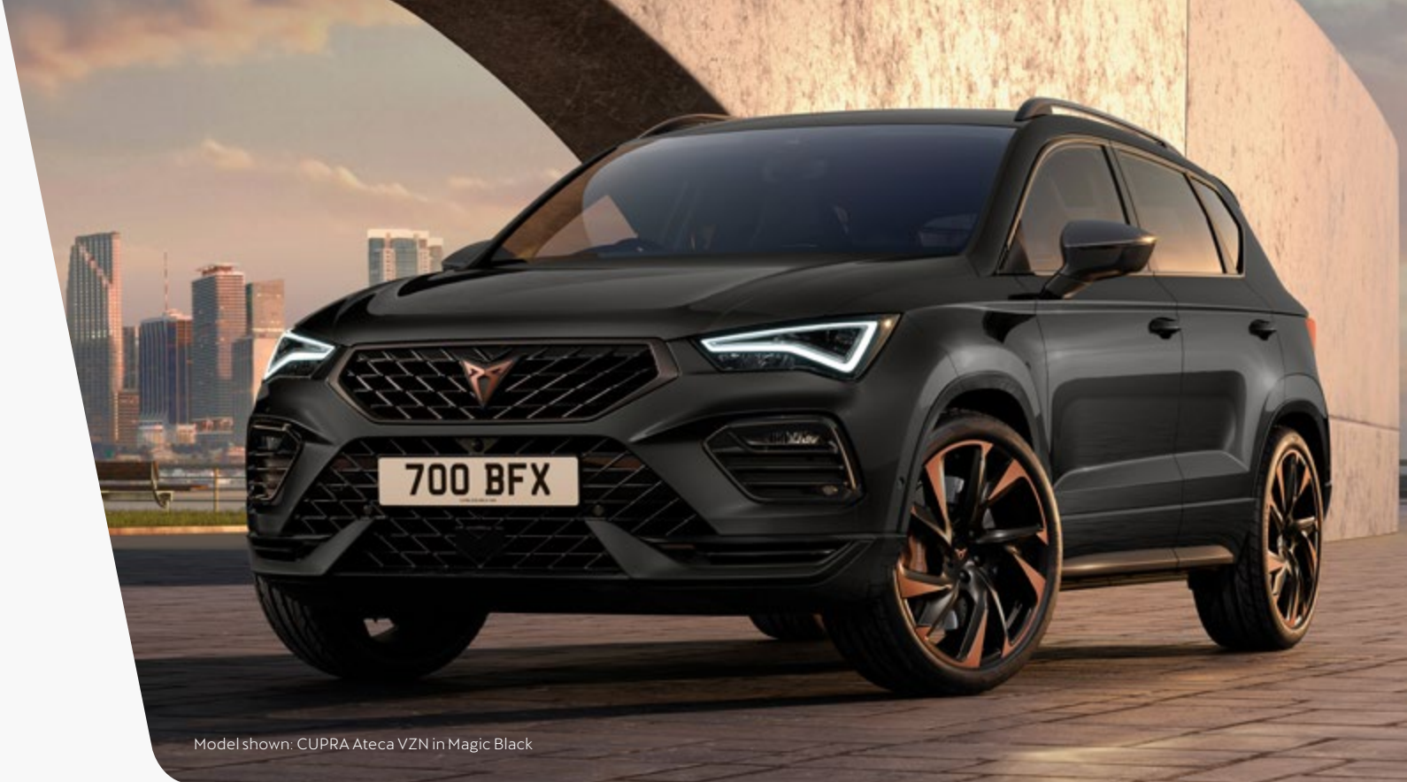
Model shown: CUPRA Ateca VZN in Magic Black