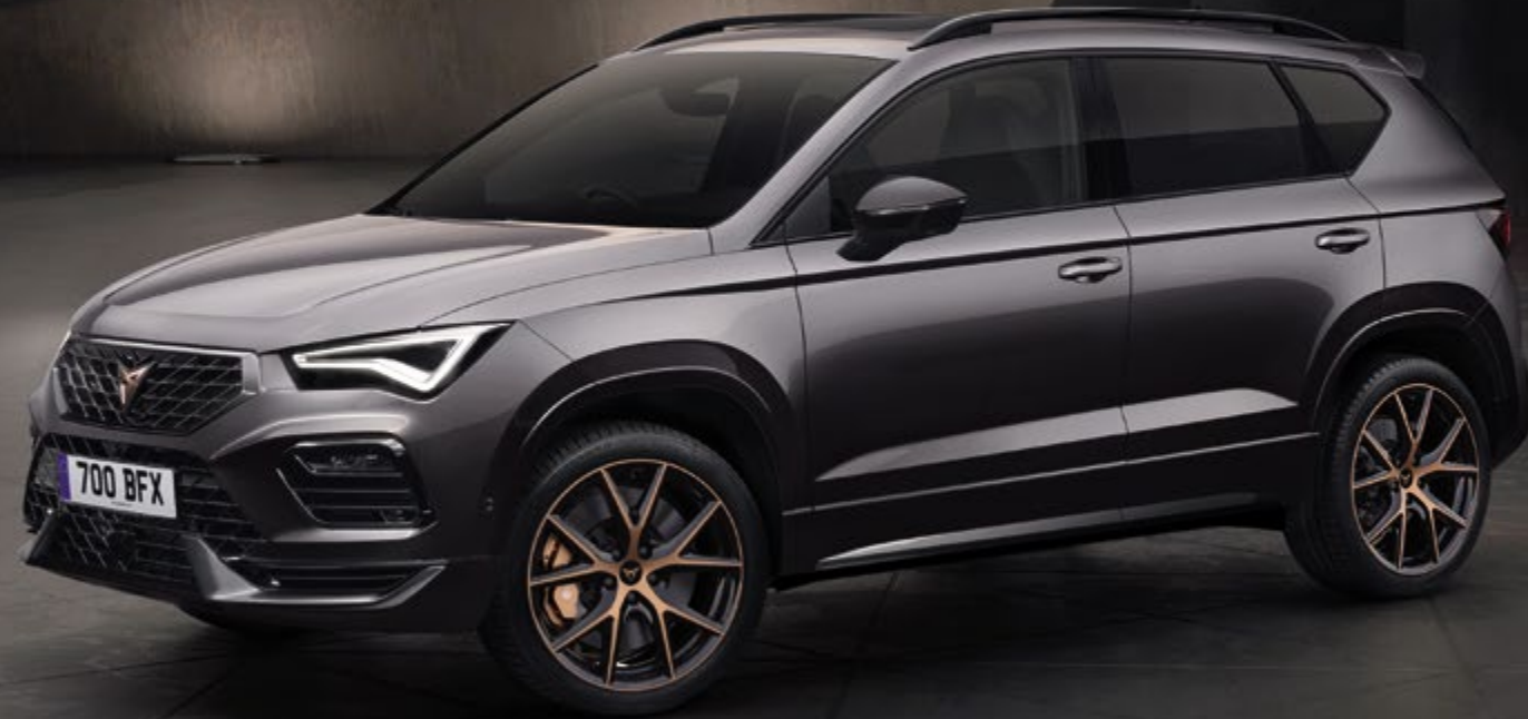
Model shown: CUPRA Ateca VZ3 in Graphite Grey