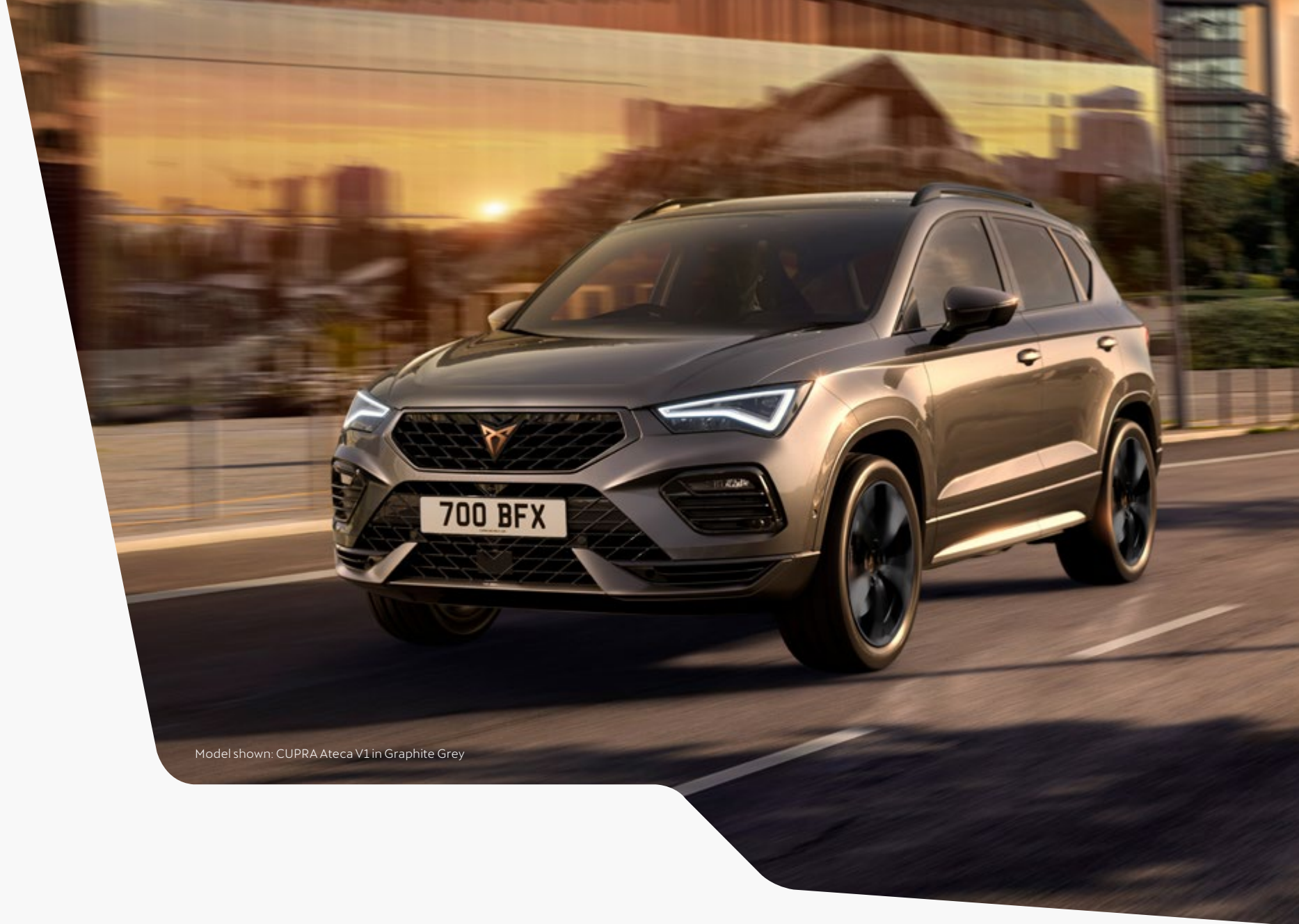
Model shown: CUPRA Ateca V1 in Graphite Grey

The CUPRA Connect services can be operated only by using available public communication technologies. Please note that due to development of these technologies, especially mobile networks, CUPRA cannot guarantee consistent availability in all countries for the duration of CUPRA Connect services. Possible changes in technology may cause permanent unavailability of them.