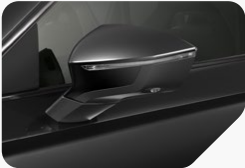
Black Magic V1 | V2 | VZ1 | VZ2 | VZ3 | VZN