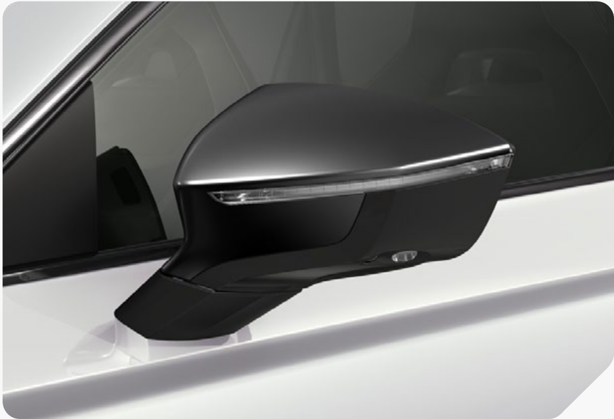
Bila White V1 | V2 | VZ1 | VZ2 | VZ3